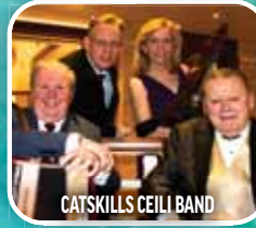
CATSKILLS CEILI BAND