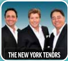
THE NEW YORK TENORS