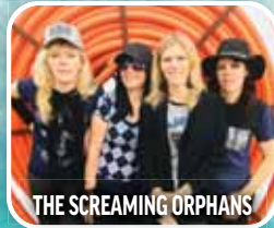
THE SCREAMING ORPHANS