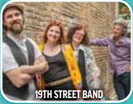
19TH STREET BAND