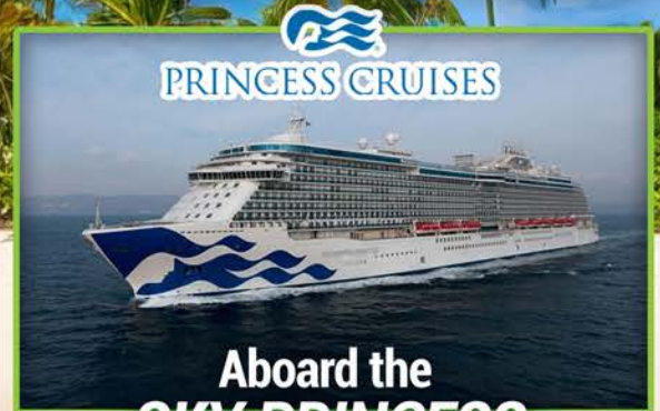
Aboard the SKY PRINCESS