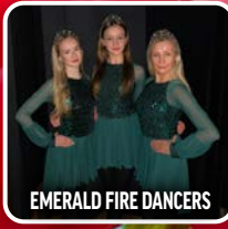
EMERALD FIRE DANCERS