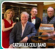
CATSKILLS CEILI BAND