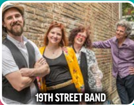
19TH STREET BAND