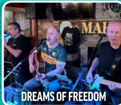
DREAMS OF FREEDOM