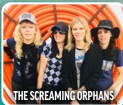
THE SCREAMING ORPHANS