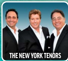
THE NEW YORK TENORS